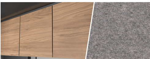
+ Wood décor Ashton