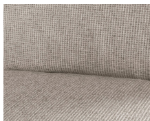
+ Upholstery Heron (partial textile- leather) incl. driver and passenger seat covers ○