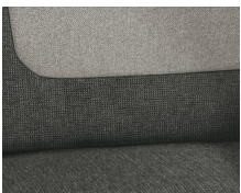
+ Upholstery Calypso incl. driver and passenger seat cover ○