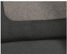
+ Upholstery Ravello