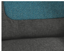
+ Upholstery Salerno incl. driver and passenger seat cover ○