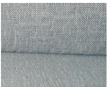
+ Upholstery Drake