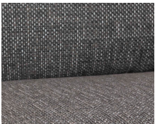
+ Upholstery Floyd