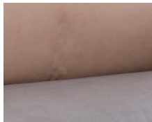
+ Upholstery Duke