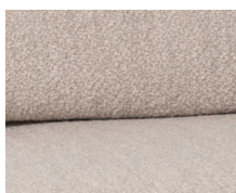
+ Upholstery Olea