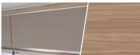
+ Wood décor Ashton