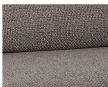
+ Upholstery Selma