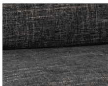
+ Upholstery Lona