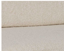
+ Upholstery Tropea ○